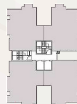
CLUSTER-A&B FLOOR 1 TO 10

3 BHK + 3 TOILETS • Super Area = 144.00 sq.mt. (1550 sq. ft.) 3 Bedrooms • Drawing/Dining • 3Toilets • 4 Balconies