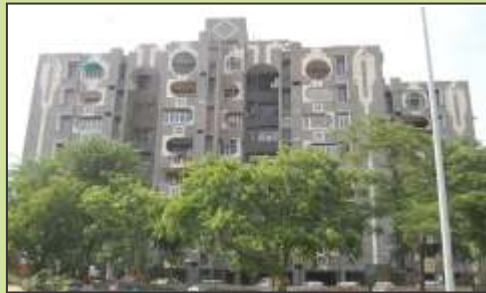
Arur Co-operative Apartments (Delivered)