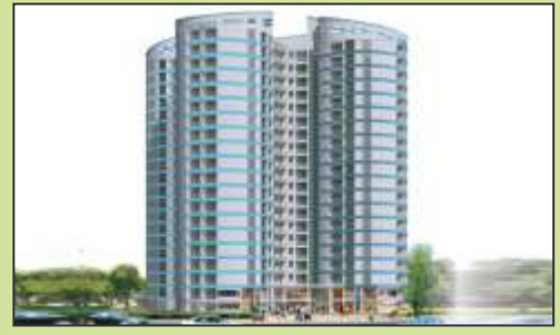
Apex Acacia Valley (Delivered)