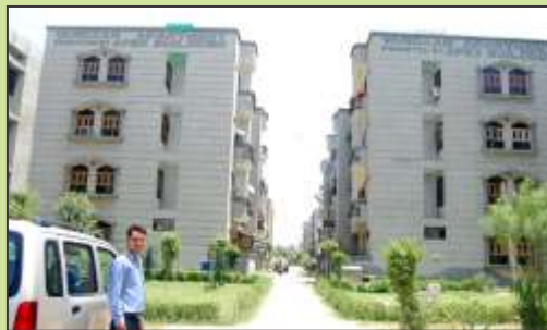
Vardan Apartments (Delivered)