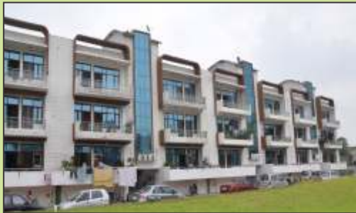
Apex Royal Castle (Delivered)