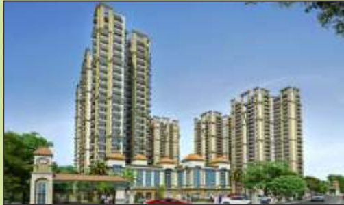
Apex Athena (Ongoing Project)