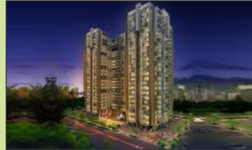
Apex The Florus (Ongoing Project)