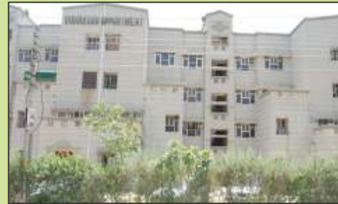
Suraksha Sehkari Awas Samiti (Delivered)