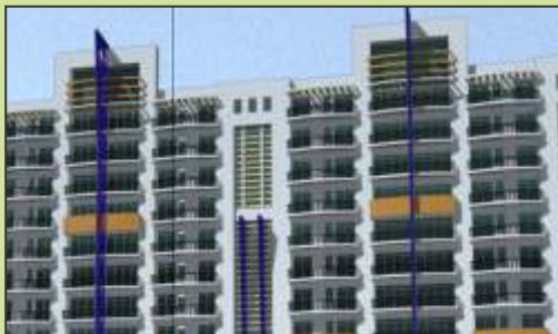
Apex Green Valley (Delivered)