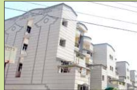
Siddha Vinayak S. S. Awas Samiti (Delivered)