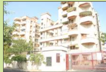
New Adarsh Apartments (Delivered)