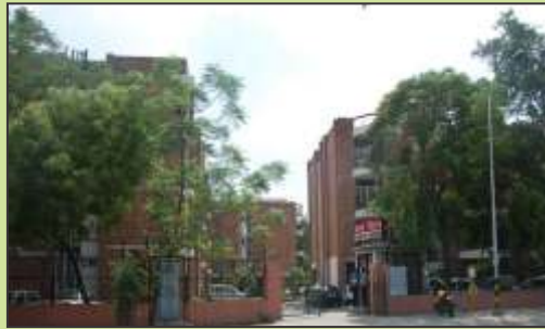
Kala Vihar Co-operative Gr. H. Society (Delivered)