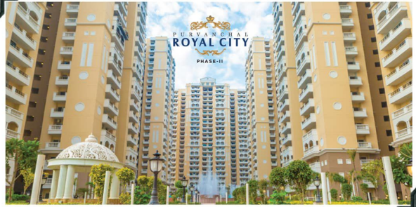
Purvanchal Royal City Phase-1 (CHI-V, Greater Noida)