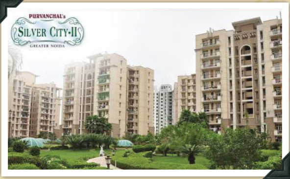
Purvanchal Silver City II (Gr. Noida)