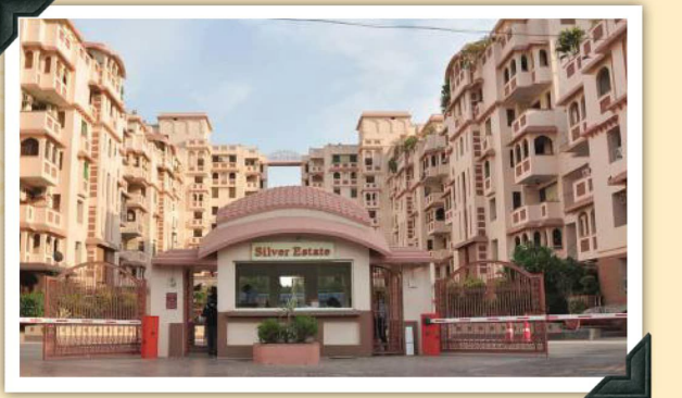
Purvanchal Silver Estate (Sec-50, Noida)