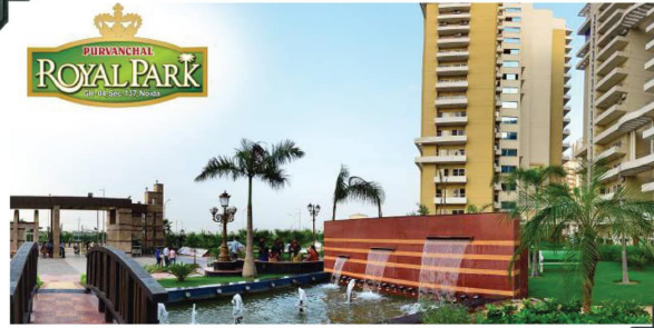
Purvanchal Royal Park (Sec-137, Noida)