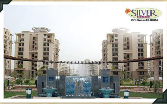
Purvanchal Silver City (Sec-93, Noida)