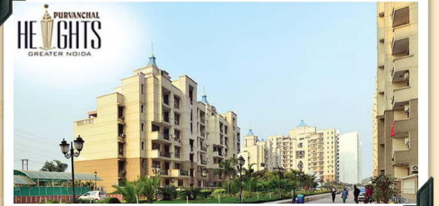
Purvanchal Heights (Gr. Noida)